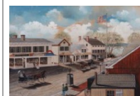
Edward Lange, Lower Main Street, Northport , 1880. Watercolor, gouache, and lead pencil on paper. Collection of Preservation Long Island, 2011.2.