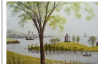
Detail of Rufus Porter's mural, likely early 1830s, in the Andrews House in West Boxford, MA. Distemper paint on plaster.